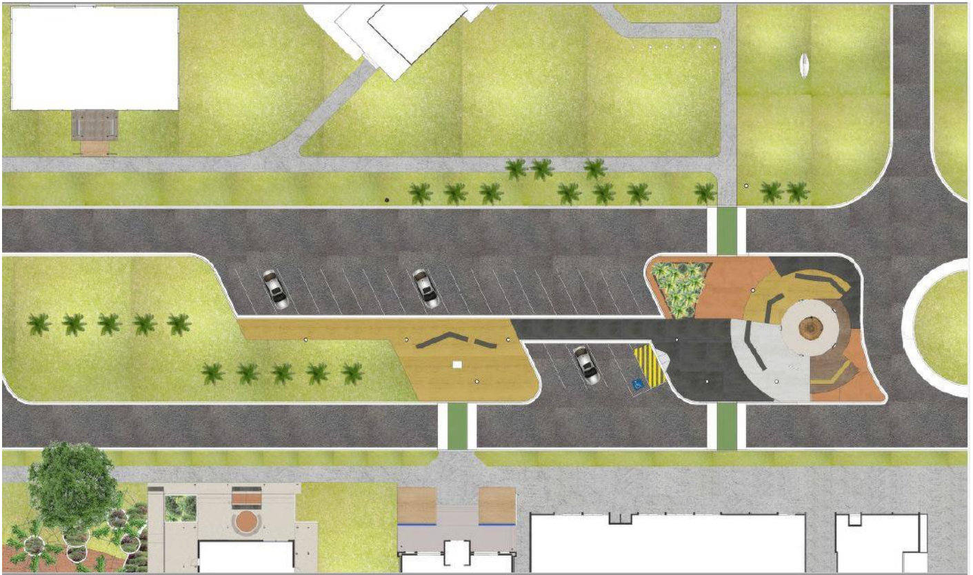
MUNI Street – Central crossing at Tree of Knowledge