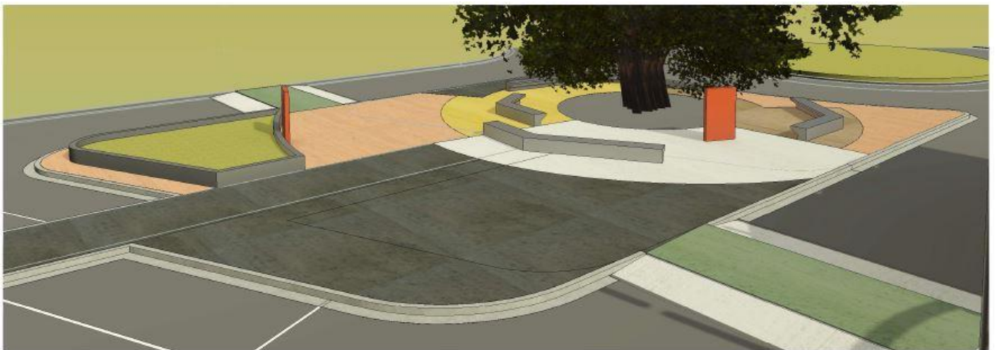
3D Render – Tree of Knowledge