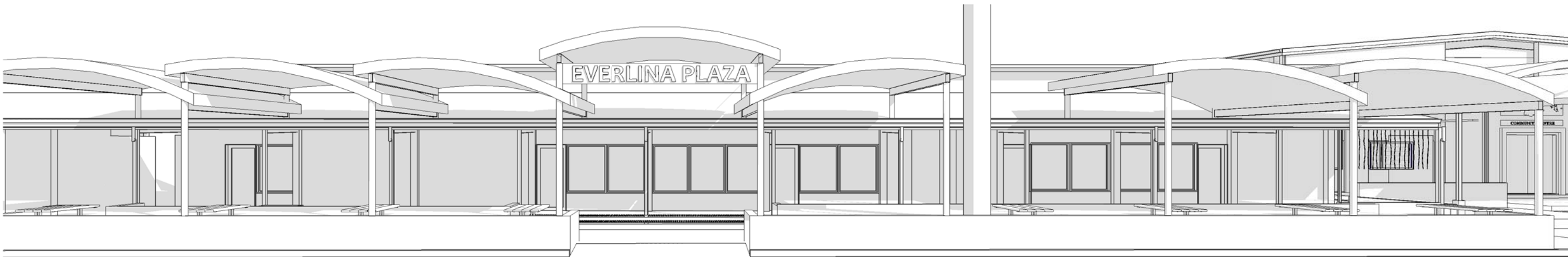
EVERLINA PLAZA 3D VIEW 1